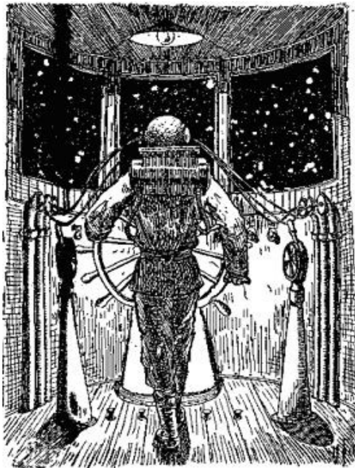
—Ossian Ström fattade ratten med kraftiga händer och lotsade luftskeppet med en häpnadsväckande säkerhet lyckligt förbi de uppskjutande, snöhöjda bergstinnarne. (Ur: »En bröllopsresa i blå etern».)

betrayal, i.e. Karin Ström: he is charred in the lava flow. All this sounds very James Bond, and it is useful to recall that the plot is from as early as 1906—1907. The third part takes place 25 years later. Ossian and Karin Ström's son Georg is an assistant at the observatory in Kinnekulle. A space ship crashes nearby, in which there are three skeletons. In a package is found a manuscript called "The Diary of the Skeleton", i.e. Ossian Ström's spiritual testament to his son Georg, with an account of his and the two friends' stay on Mars. They were not crushed when landing on Mars thanks to the friendly inhabitants of the planet, who regulated the projectile momentum through targeted waves. After some time on Mars, the Swedish trio is sent back home, but on arrival in the atmosphere of the Earth an unexpected deviation from the course occurs, and instead of landing the spaceship becomes a satellite circling the Earth for 25 years, before it falls down for unknown reasons, and the truth is revealed.