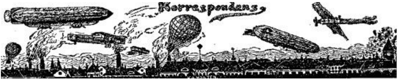
“KORRESPONDENS”. Vignette by Ossian Elgström for Kamraten 's correspondence column in 1910:19, where interest in utopian air trips is emphasized.